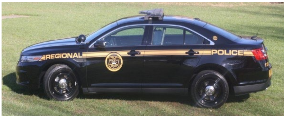
2017 Ford Taurus

Patrol vehicles Administrative vehicles Special-service vehicles and trailers.