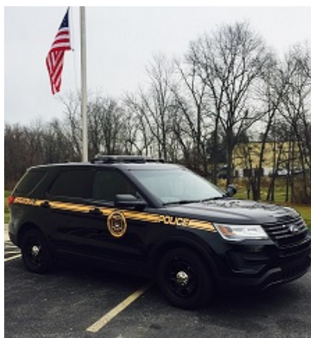
2019 Ford Explorer Utility