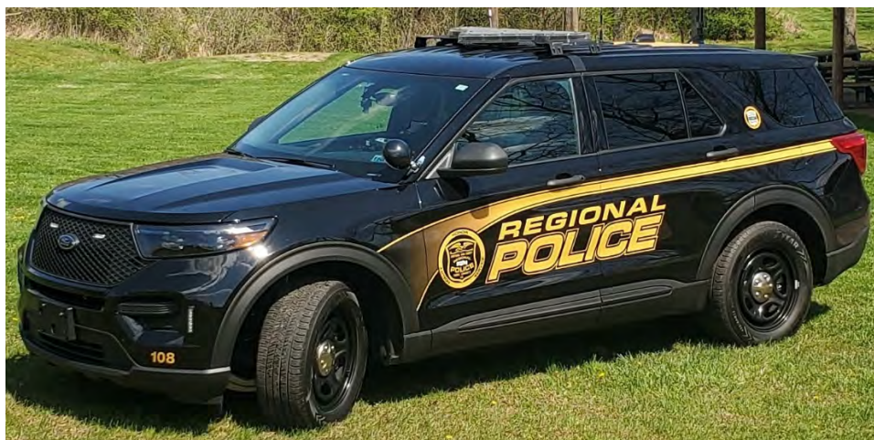
2020 Ford Police Interceptor Utility