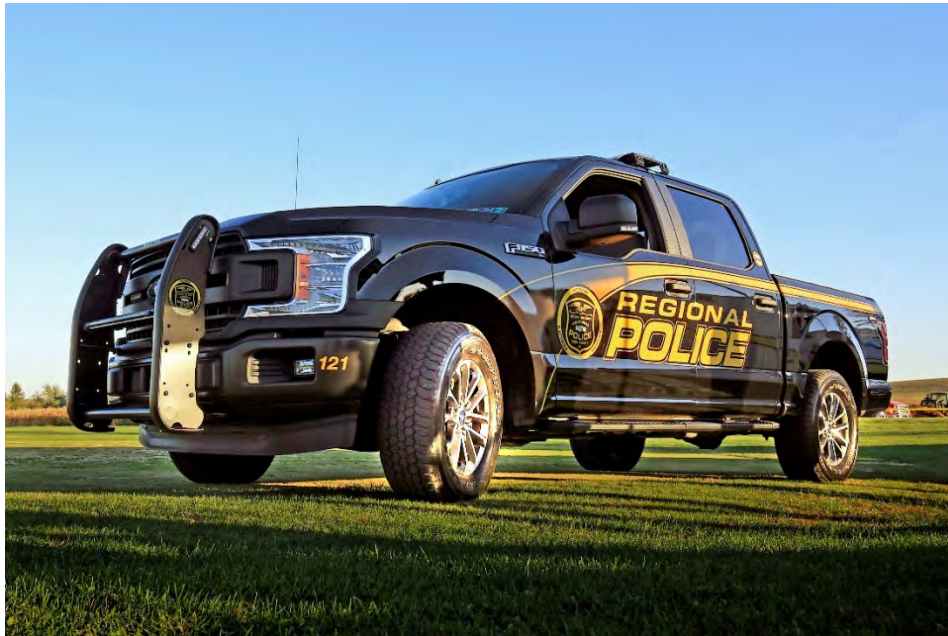
2020 F-150 Patrol Unit

Patrol vehicles Administrative vehicles Special-service vehicles and trailers.